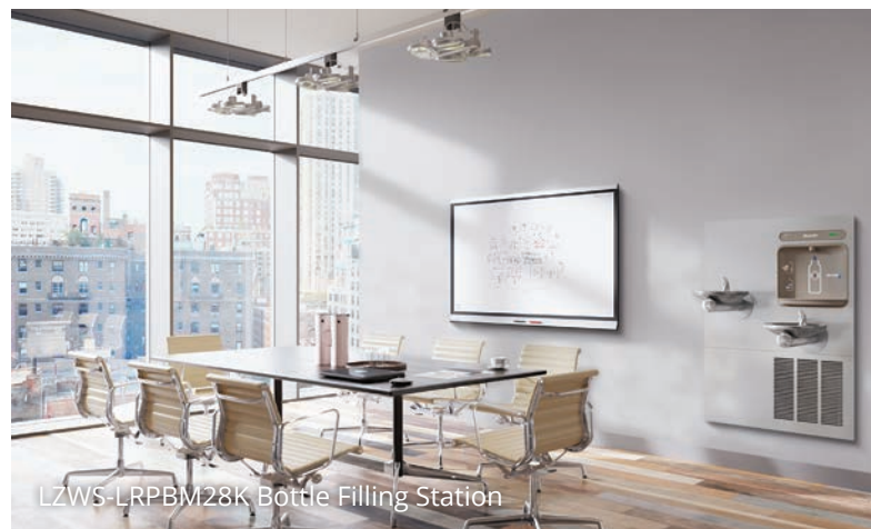
LZWS-LRPBM28K Bottle Filling Station

Bottom-right: ELUHH3017TPD Sink, LKAV2061LS Faucet