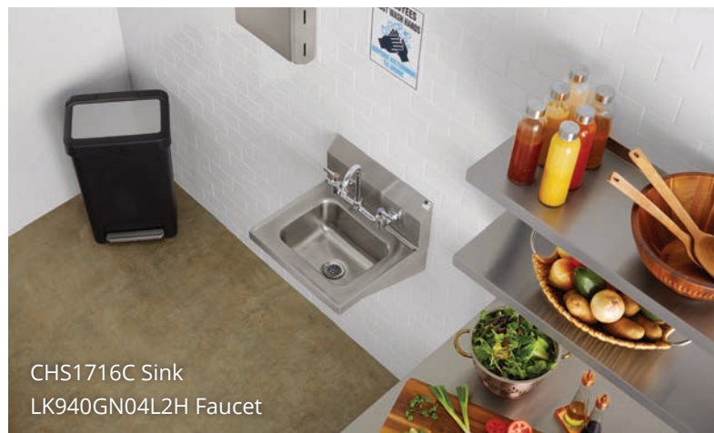
CHS1716C Sink LK940GN04L2H Faucet