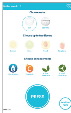
Flavor icons unavailable