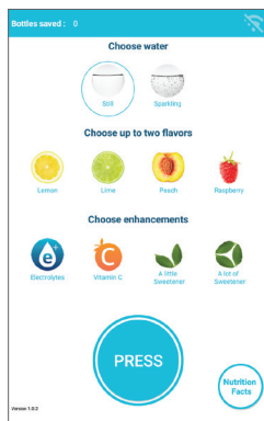
Flavor icons available