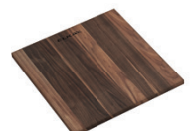
Walnut cutting board