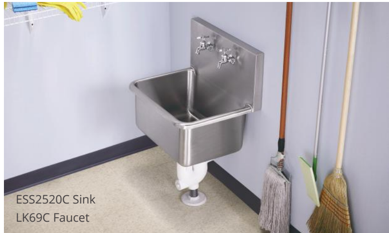
ESS2520C Sink LK69C Faucet

Available in a range of styles and with a variety of features, our faucets are designed for sink applications throughout your space.