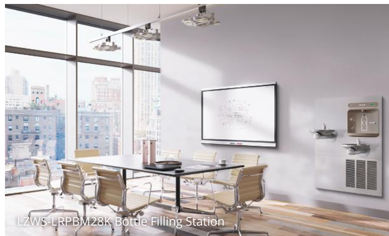
LZWS-LRPBM28K Bottle Filling Station

Bottom-right: ELUHH3017TPD Sink, LKAV2061LS Faucet