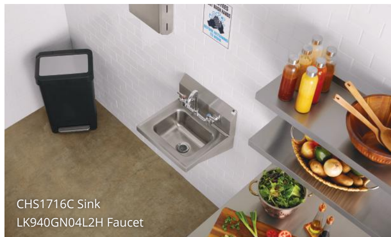
CHS1716C Sink LK940GN04L2H Faucet