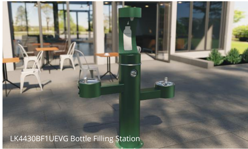
LK4430BF1UEVG Bottle Filling Station

From bottle filling stations to water coolers and fountains, our filtered and vandal-resistant drinking products offer the ultimate solution for your office and retail environments.