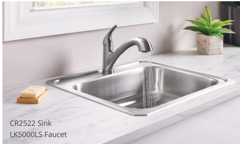
CR2522 Sink LK5000LS Faucet

Our faucets are available in a range of models to fit every configuration and application.