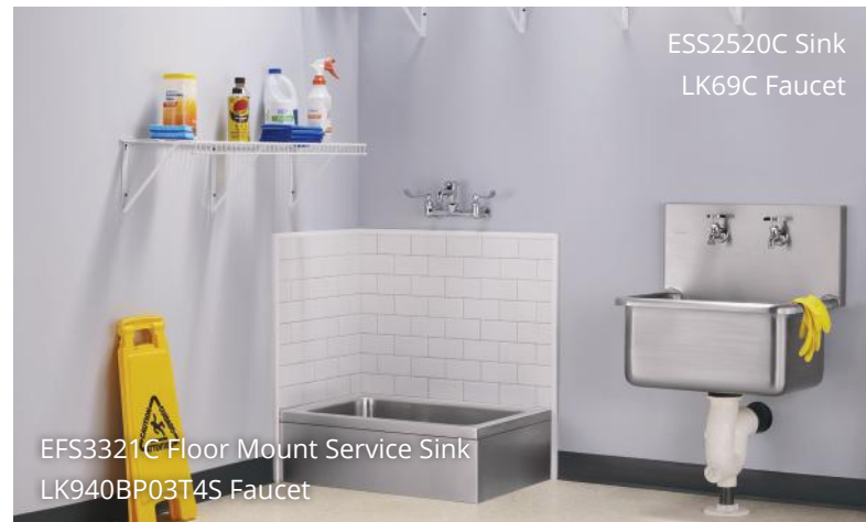
ESS2520C Sink LK69C Faucet