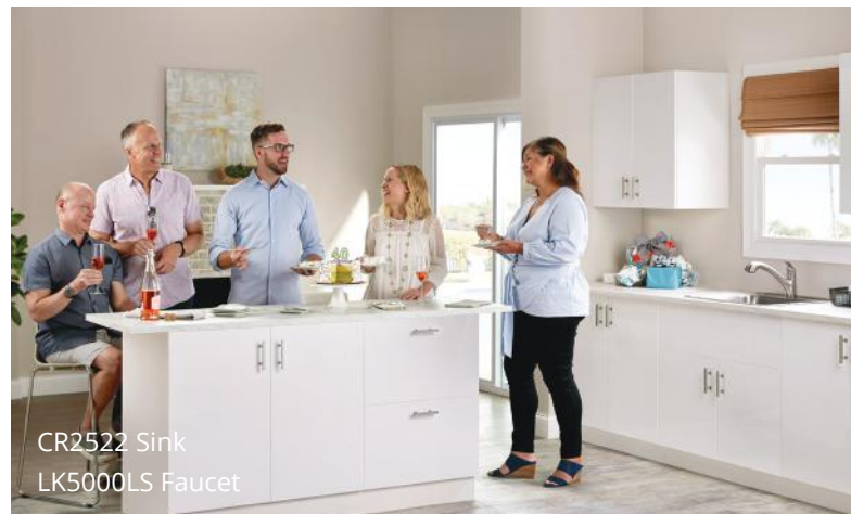
CR2522 Sink LK5000LS Faucet

Top: LR33221 Sink, LKAV3031LS Faucet; Bottom-left: LZSTL8WSP Bottle Filling Station; Faucet; Bottom-right: LKHA4032LS