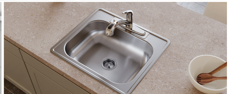
D125223 SINK, LK5000CR FAUCET