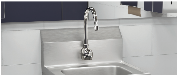
CHS17161 SINK, LKB722C FAUCET