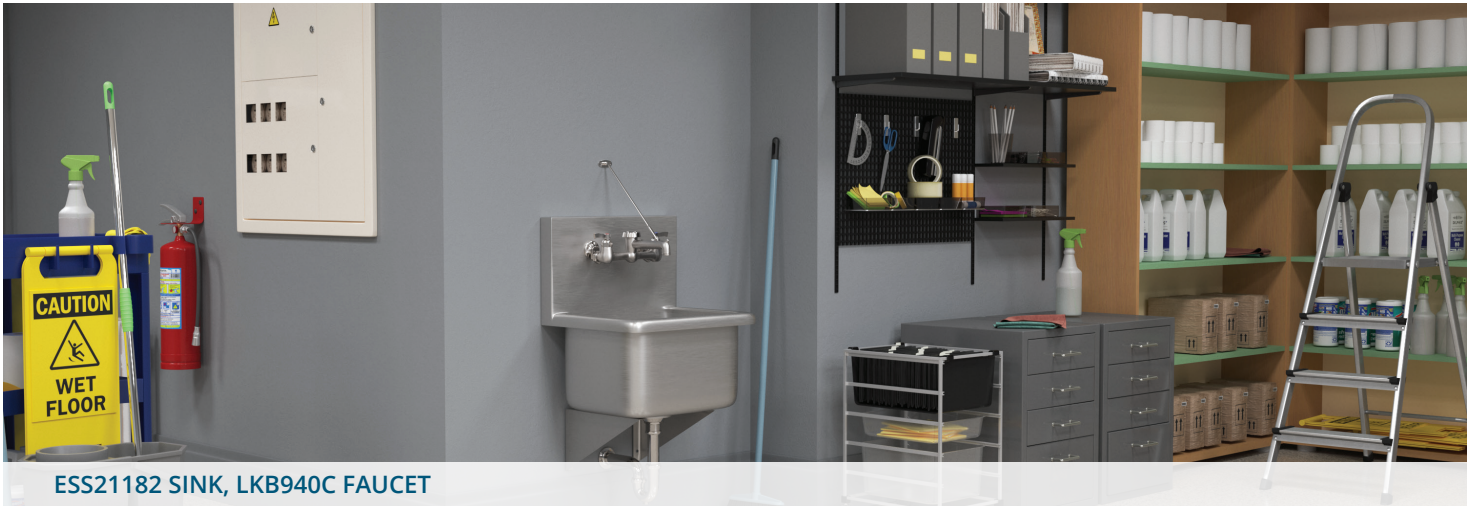
ESS21182 SINK, LKB940C FAUCET