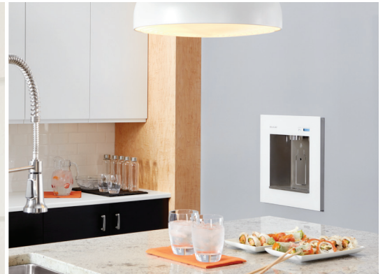
LBWDC00WHC EZH2O LIV® PRO WATER DISPENSER