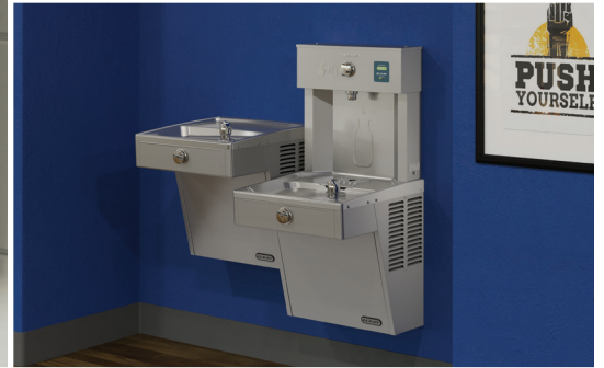
LVRCTL8WSK BOTTLE FILLING STATION