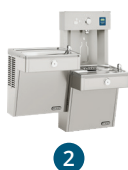
Manufacturing Floor LVRCTL8WSK