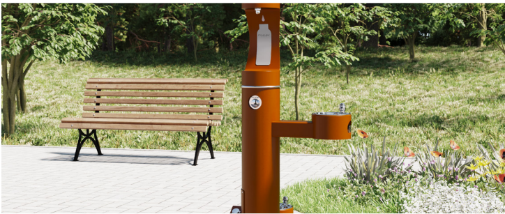
LK4420BF1UDBTER Bottle Filling Station