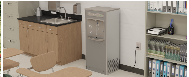
DSSBF8S Bottle Filling Station