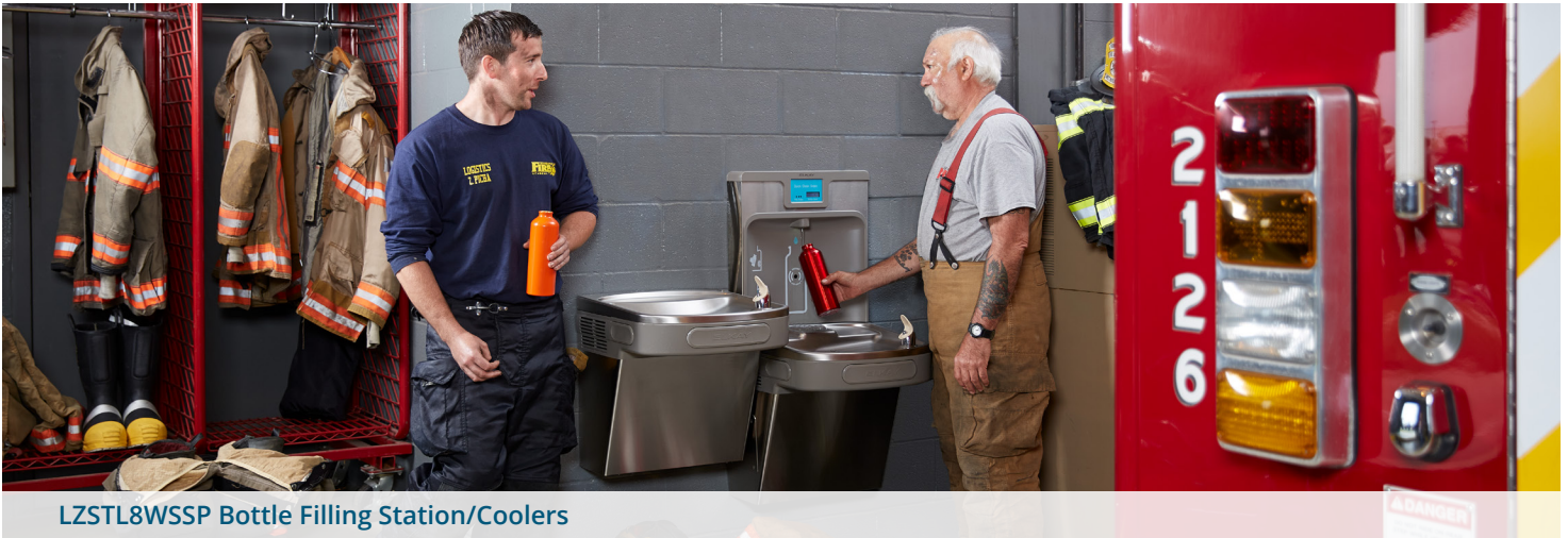
LZSTL8WSSP Bottle Filling Station/Coolers