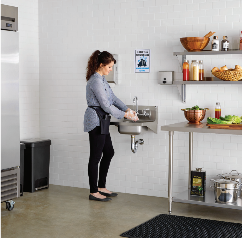
CHS1716C SINK, LK940GN04L2H FAUCET