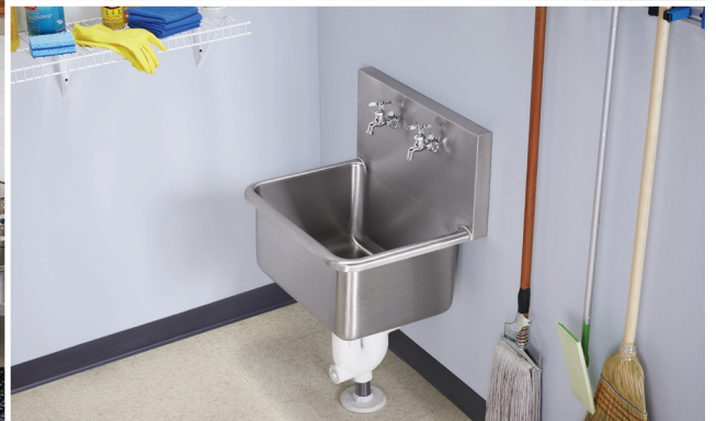
ESS2520C SINK, LK69C FAUCET