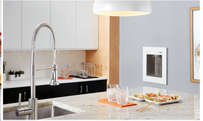
ELUHH3017TPD SINK, LKAV2061LS FAUCET