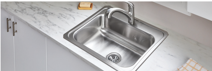
CR2522 SINK, LK5000LS FAUCET