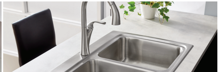
LR33221 SINK, LKHA4032LS FAUCET