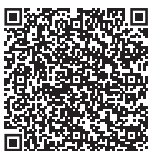
Maintenance Closets CHS1716C