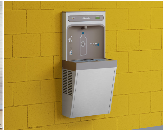
LZ8WSSMC Bottle Filling Station