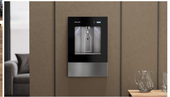
LBWDC00BKC Water Dispenser