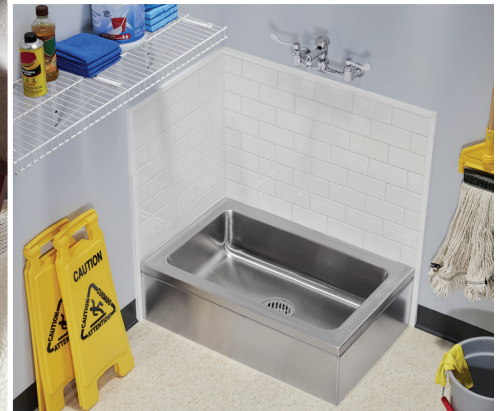
EFS3321C FLOOR MOUNT SERVICE SINK LK940BP03T4S FAUCET