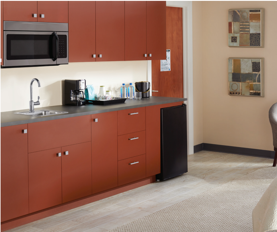
BCR15 SINK, LKD208513C FAUCET