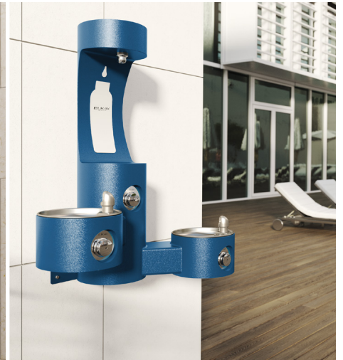
LK4409BFBLU Bottle Filling Station