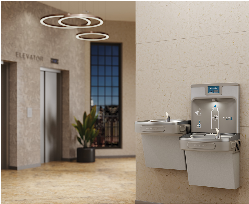
LZSTL8WSLP Bottle Filling Station/Coolers