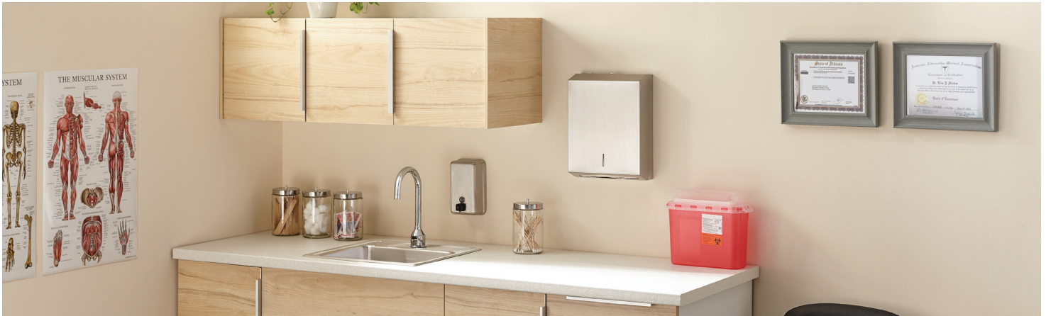
LR1918 SINK, LKB721C FAUCET