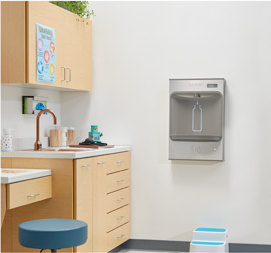
LMASMB Bottle Filling Station