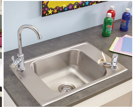
CDKR2517 SINK LKD208513LC FAUCET