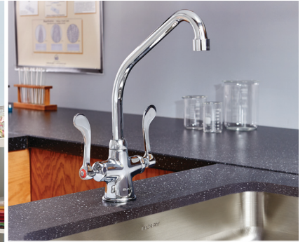
ELUHAD211555PD SINK LK500HA08T4 FAUCET