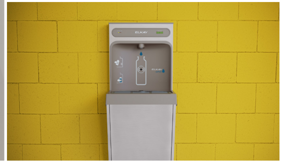
LZ8WSSSMC Bottle Filling Station/Cooler