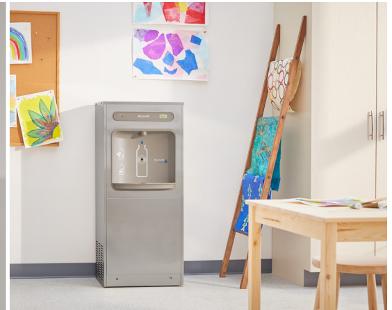
DSSBF8S Bottle Filling Station/Cooler