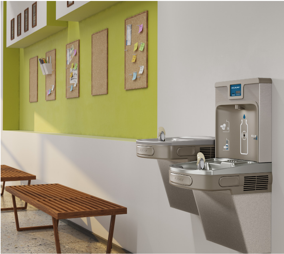
LZSTL8WSLP Bottle Filling Station/Coolers