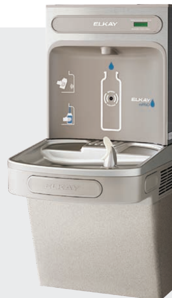
LZWSRK – Retrofit Bottle Filling Station Kit LZS8S – Existing EZ Cooler

The ezH2O retrofit kit can be installed on existing Elkay water coolers. Rough-in replacement allows replacement over existing plumbing and electrical lines for a hygienic and refreshing hydration solution.