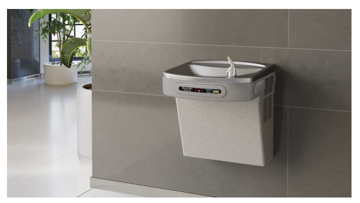
View our complete portfolio at elkay.com/health-smart.