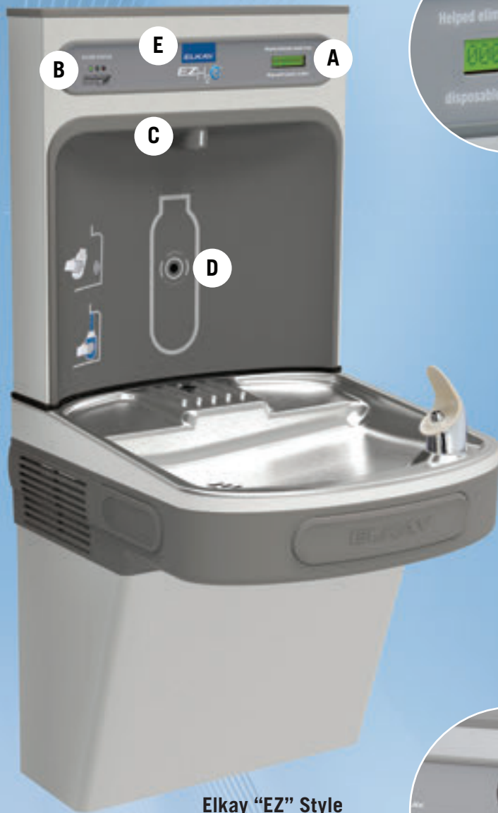
Elkay "EZ" Style Water Cooler