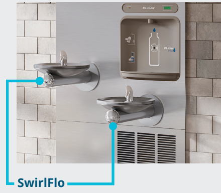
Sleek styling enhances all architectural types, whether classic or cutting edge.