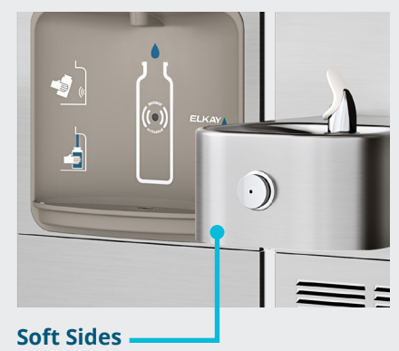
Softly rounded corners and contoured basin provide a safer splash-resistant surface.