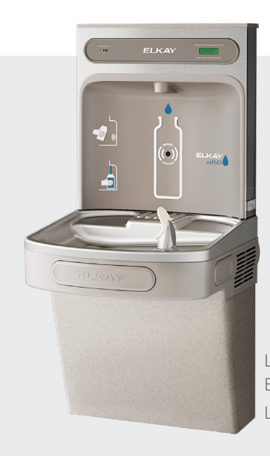
LZWSRK – Retrofit Bottle Filling Station Kit LZS8S – Existing EZ Cooler

Upgrade non-filtered coolers to filtered with the LZWSRK and EWF3000 retrofit products.