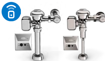
ZEMS6000 AquaSense® connected flush valve