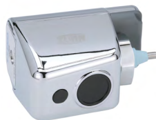
ZERK E-Z Flush® retrofit kit