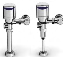
EZ Gear Technology Sensor flush valve