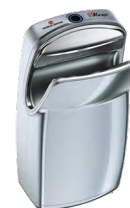
VMax® V2 HEPA-filtered vertical sensor hand dryer