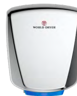
VERDEdri® HEPA-filtered sensor hand dryer