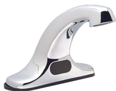
Z6915-XL AquaSense® sensor faucet