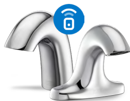
Serio® Series Connected faucets