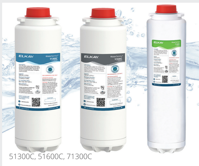
51300C, 51600C, 71300C