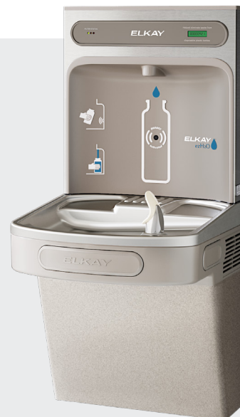
LZWSRK – Retrofit Bottle Filling Station Kit LZS8S – Existing EZ Cooler

Upgrade non-filtered coolers to filtered with the LZWSRK and EWF3000 retrofit products.